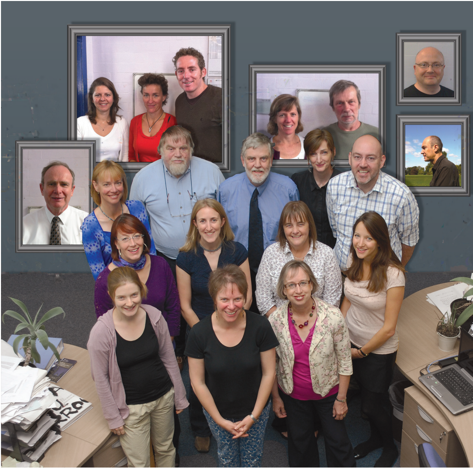
The UKCIP team, 2011